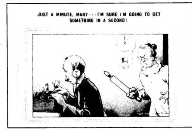
Fig. 45 . The chance of getting America or other distant stations often kept the really keen listener-in up till the early hours of the morning.

In the winter of 1923, just a year after broadcasting began, there were over 500,000 licensed receivers grouped around the eight main stations and one relay of the British Broadcasting Company. Unless you happened to live close to one of these stations, the type of receiver you could afford to buy did limit your listening. It would be a bad investment to purchase a cheap crystal set if you lived a hundred miles or so away from a transmitter, for the receiving range of this type of set was very limited. Of course, if money was no object, you could buy a long-range multi-valve set and be assured of hearing something entertaining practically anywhere in Britain, and there was often the possibility of picking up some really longdistance stations from Europe or even America, especially during long winter evenings when conditions were more favourable.